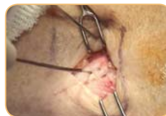
Case Example of Figure E