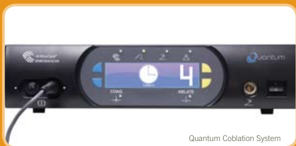
RECOMMENDED DEVICES: Quantum Coblation System and TOPAZ MicroDebrider

The TOPAZ MicroDebrider enables the debridement of soft tissue present within the tendons of the elbow, knee and ankle. The device utilizes bipolar plasma-mediated technology for creating small shallow impressions. This controlled, single application protocol has offered a minimally invasive alternative for thousands of patients for the treatment of tendons.