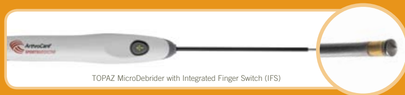
TOPAZ MicroDebrider with Integrated Finger Switch (IFS)