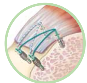
SpeedScrew Knotless Suture Bridge with Doubleplay®