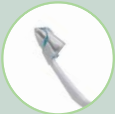
MagnumWire® High Tensile Strength Suture