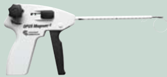
Magnum 2 Knotless Fixation Implant