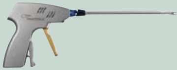
SmartStitch® with PerfectPasser® Fast, Easy, Reliable